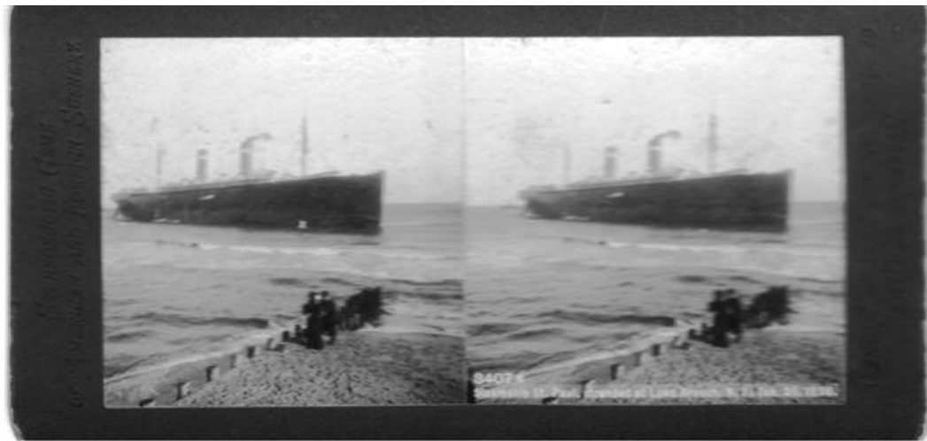
Figure 5: Stereograph of the St. Paul , Courtesy of Sharon Hazard.

Associated Press was in the business of supplying the news—a salable commodity—and the content and structure of wire reports reflected its underlying profit motive. Photographers, artists and salesmen also constructed images of the St. Paul that were designed to profit from the wreck, but photographers went to the greatest lengths to craft the most marketable images. The New York Herald lampooned the “camera fiends” who were “climbing upon the tops of spiles and fencing, placing their instruments on verandas or dipping the feet of tripods in the sea” to get “the shot.” 39 Their photographs were sensational, romantic images that reinforced the spectacle. Long Branch photographer Christian Fredericksen stated, “I didn’t intend to take any pictures at all, because I supposed they would pull her off next day...[but then] I thought I would go down and take pictures just for fun for my customers in the summer.” 40 Fredericksen was one of many entrepreneurs who sold images of the stranded St. Paul . 41 A stereograph distributed by one firm offered an impressive three-dimensional perspective of the massive liner [Figure 5]. 42 All told, salaried and freelance artists produced dozens of drawings and engravings for newspapers and periodicals that highlighted the size of the St. Paul , the precariousness of its position, and the heroism of passengers, wreckers, and first responders.