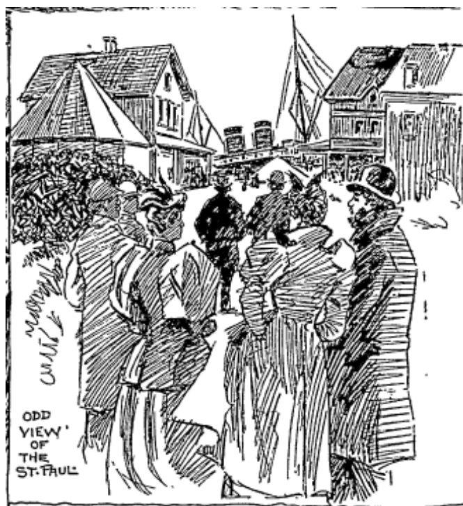
Figure 4: "Odd View of St. Paul ," New York Herald , January 27, 1896.

Published shipwreck narratives had, by the late nineteenth century, become highly standardized. The Associated Press's news monopoly ensured that most of the country would read a terse narrative that reproduced the St. Paul spectacle on a national scale by emphasizing the crowds of spectators and sensationalizing the stakes of the wreck and salvage effort. 35 Published images of the St. Paul were as standardized as the published narratives. All told, dozens of images of the St. Paul were published in local and national newspapers and periodicals. 36 Most of these depictions, drawing on the iconographic ship portrait motif, offered a broadside view of the wreck surrounded by a tempestuous sea, foregrounded by the oftentimes-crowded shore. 37 One notable departure from the "standard" shipwreck image was the drawing "Odd view of the St. Paul" published in the New York Herald [Figure 4]. 38 In it, a fashionable group men and women chat on a busy street. Two smoke stacks and a mast rise above the roofs and the liner's dark hull is barely discernable in the distance. In "Odd view" the crowd and Long Branch—the spectacle—remained the subject though the St. Paul itself was largely absent.